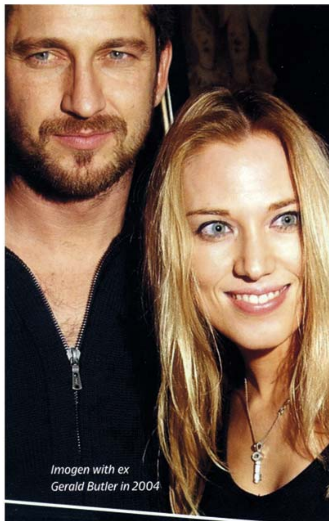
Imogen with ex Gerald Butler in 2004